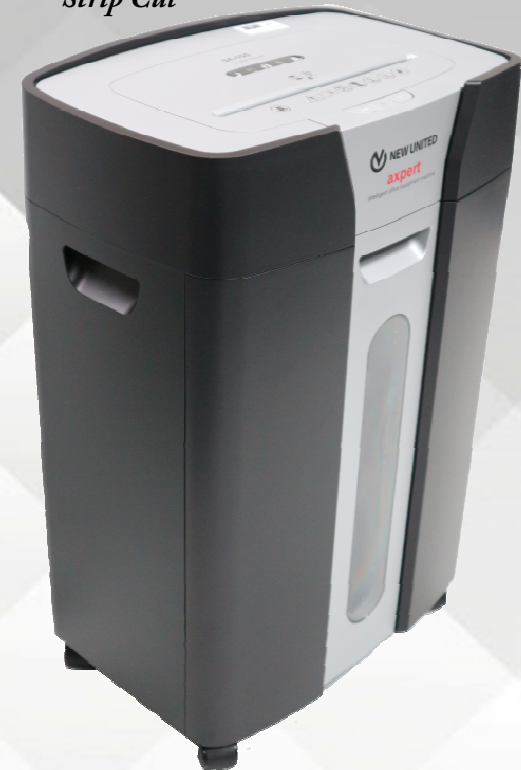
New United ST-15S